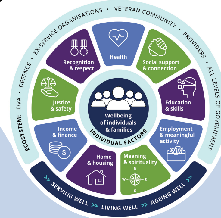
DEFENCE AND DVA ALIGNED WELLBEING FACTORS

▶ To view the Corporate Plan 2024–25 go to dva.gov.au/corporate-plan