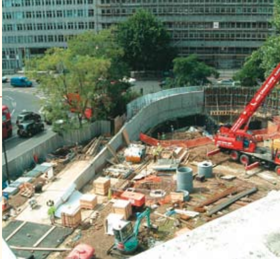
Memorial under construction - wall formwork in place and granite panels ready to uncrate