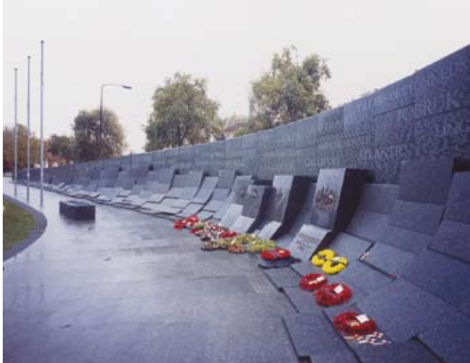
Wreaths at Australian War Memorial, London after dedication service