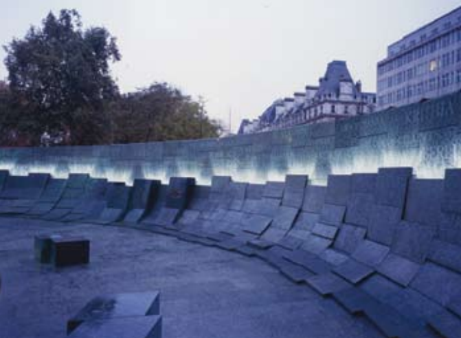
Australian War Memorial, London at night