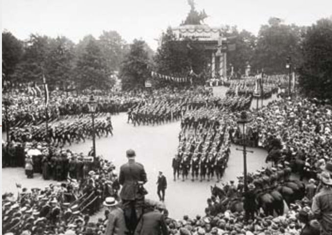
Two Australian soldiers (right foreground) watch the Royal Navy contingent at the Victory March at Hyde Park Corner, 1919.

the front line. In World War II, as total war engulfed the nation, those on the home front toiled for victory in factories and farms.