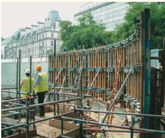
Construction of formwork for supporting walls

area for large scale gatherings such as that expected on Anzac Day each year.