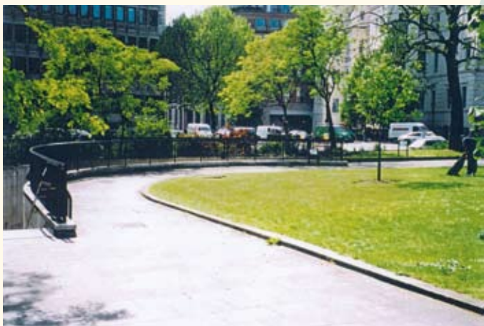
Memorial site, Hyde Park Corner prior to construction

The site of the Australian War Memorial is within the 1.5 hectare parkland known as Hyde Park Corner, in the heart of London. The site was identified as a potential memorial location in the master plan report on initiatives to improve and upgrade the area. It was commissioned by English Heritage on behalf of the Hyde Park Corner Steering Group, comprising representatives from major London authorities including Westminster City Council.