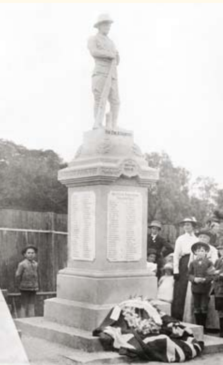
Memorial unveiled in December 1917 to honour the men and women of Ipswich, Queensland, who enlisted in World War I.

Department of Veterans' Affairs Internet site and the public was invited to review the selection before the names were finalised.